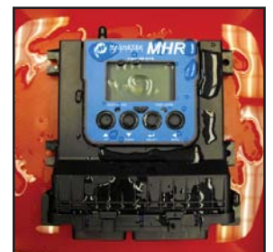
Rugged waterproof design