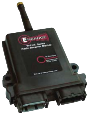
CAN-6 Receiver shown