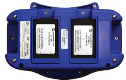
Main battery and spare battery packs